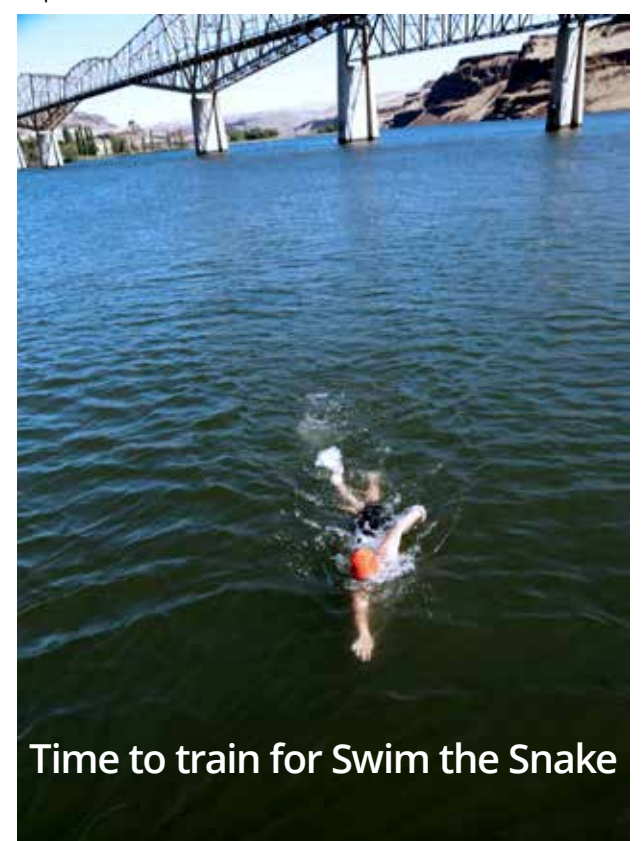
Time to train for Swim the Snake