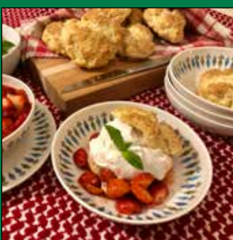
Strawberry Shortcake (see page 7)