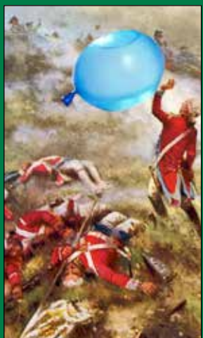
Kirkman House Kids Camp (see page 3)