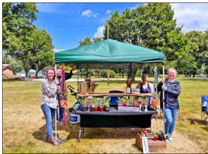
Waitsburg Farmers Market Saturday, May 30 Preston Park 9 a.m. to 1 p.m.