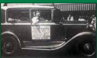
Pioneer Portraits (see page 6)