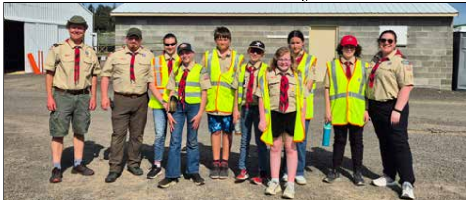
The troop helped the Lions Club with parking detail at the 16th Annual Rib Feed.

On May 2, Troop 337 assisted at the Waitsburg Lions Club Rib Feed at the fairgrounds. The troop has assisted with parking at the rib and salmon feeds. The Waitsburg Lions Club sponsors the troop as its Charter Organization through the BSA.