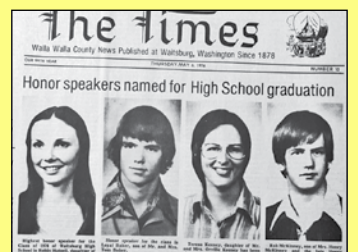
Pioneer Portraits (see page 6)