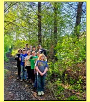
Scouts at work (see page 3)