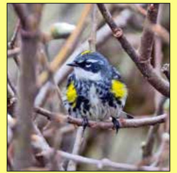
Palouse Outdoors (see page 5)