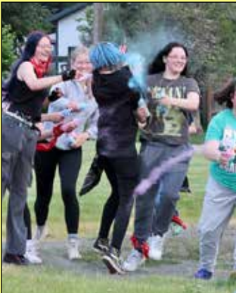
Color fight (see page 3)