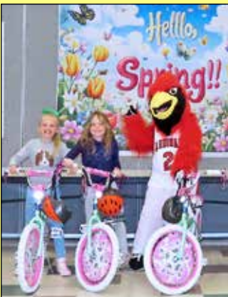
Books for Bikes (see page 3)