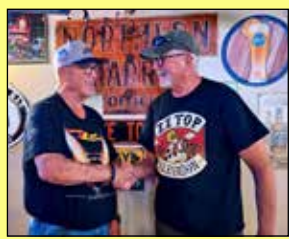
ZZ Top Bonding (see page 2)