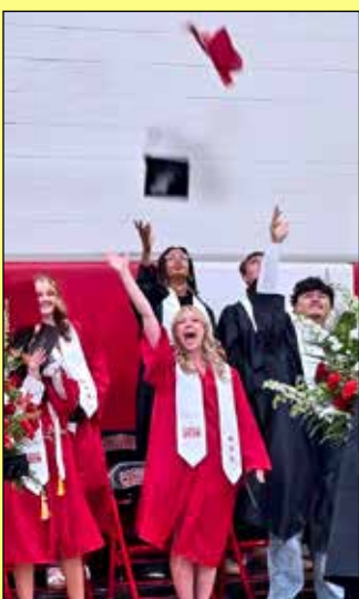
Graduation (see pages 3 & 4)