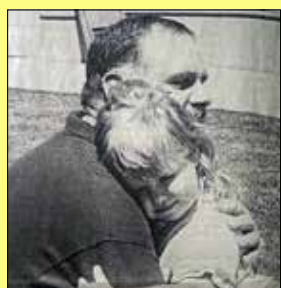
Pioneer Portraits (see page 6)