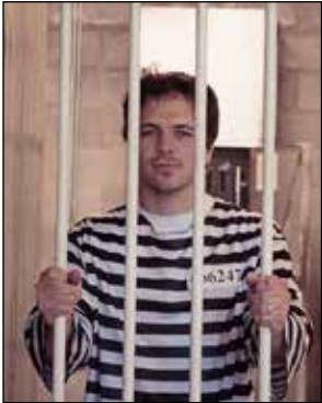
www.fwwm.org Escapee at Ft. Walla Walla