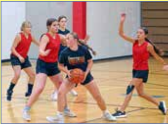
Lady Cardinals (see page 3)