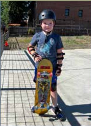
Skateboard Camp (see page 3)