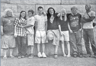
Pioneer Portraits (see page 4)