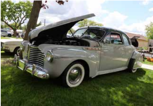
Saturday, May 17 from 10 a.m. to 3 p.m at Preston Park.