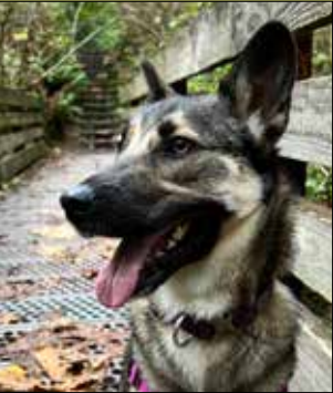
Coffee pop-up (see page 5)