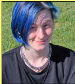
Senior portraits (see page 7)