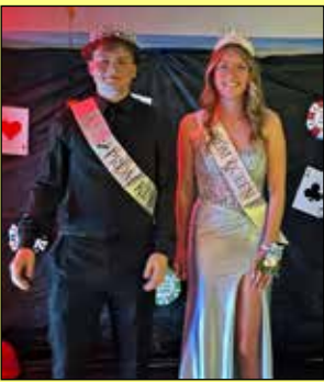
Prom (see page 3)